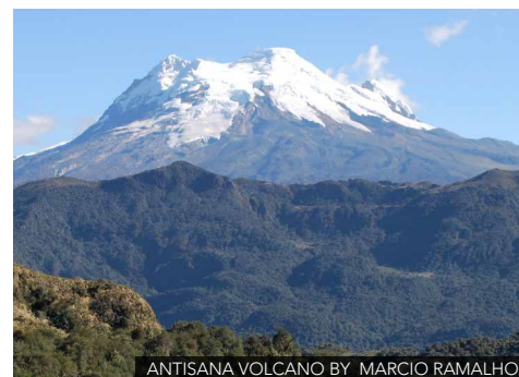
ANTISANA VOLCANO