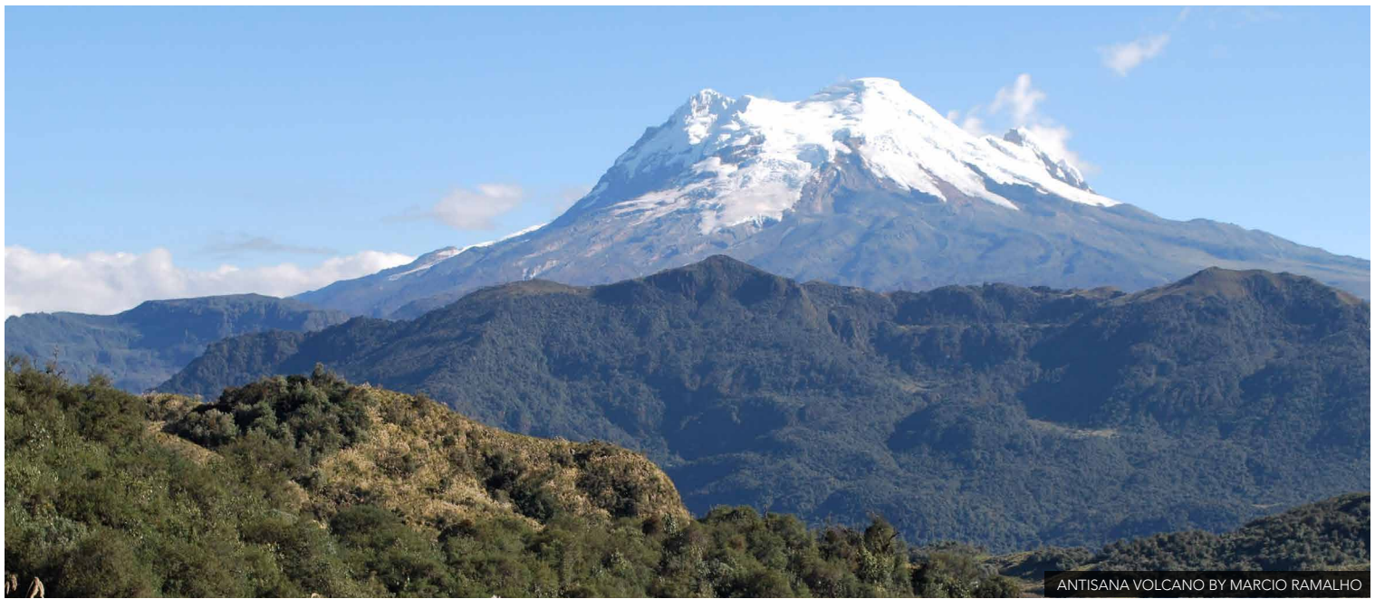
ANTISANA VOLCANO