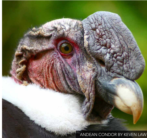
ANDEAN CONDOR

Transfer to the airport for the flight home. (B)