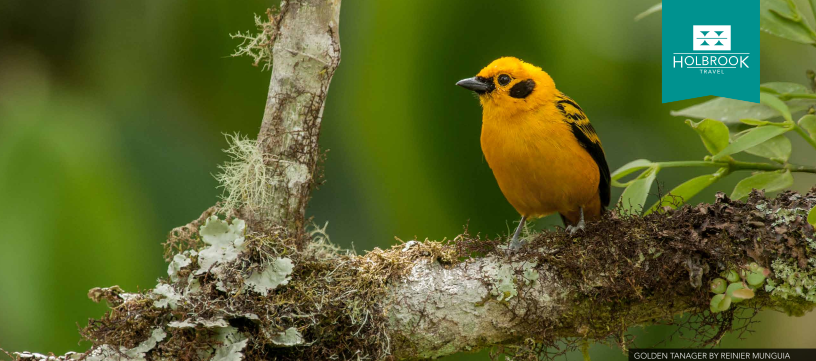
GOLDEN Tanager